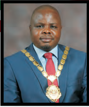
Cllr Pule Shayi Executive Mayor