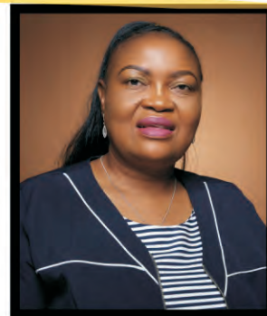
Governance and shared services: Cllr Basani Shibambu